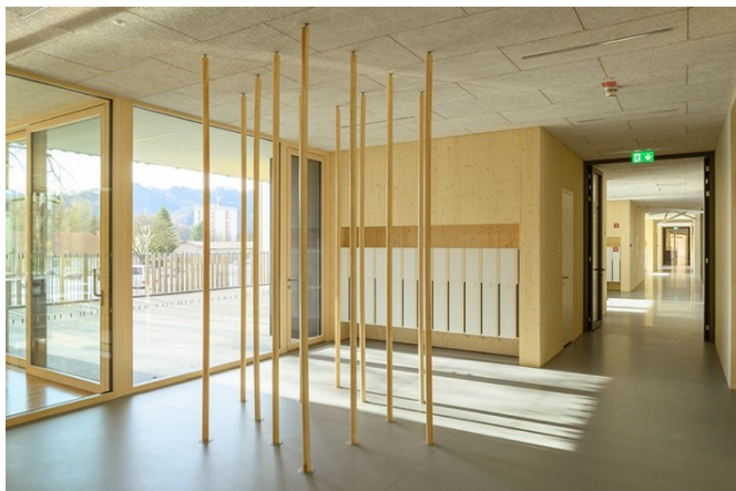
Fig. 14. Interior furniture in the form of climbing poles.