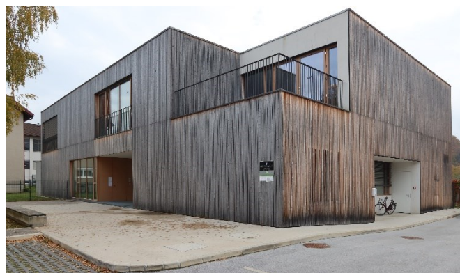
Fig. 1. Kindergarten in Loče, wooden facade connecting the interior wood with the exterior.

The fact that employees, educators, teachers feel comfortable in an environment with elements of wood also contributes to the positive atmosphere of the environment and the joy of children visiting this environment (this fact has also been proven in hospitals: if doctors feel good in the workplace, it has much better effects on patients than a top-class equipped room). As to negative connotations, we caught the answer that this natural material can allegedly cause or aggravate allergies. When asked what they would like to change in connection with the kindergarten's architecture, we did not catch any other negative associations with wood, only concerns about fire protection, which seem irrelevant to us. Other reservations about the architecture were: non-functional layout of the playrooms, lack of changing tables near the door, non-functional terraces on the first floor that are not covered, lack of flexible relaxation areas for individual relaxation.