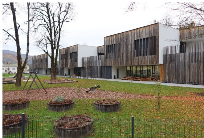
Fig. 11. Kindergarten in Škofja Loka, wooden facade indicating the supporting wooden visual material.

The questionnaire respondents are convinced that the wooden material in the interior of their school calms the children; it is not only the premises as such, but also the materials used in the premises which can make the children feel at home without appearing formal. The respondents also stated that wood and wooden surfaces have a positive influence on the children's concentration, because they have a warm, homely, and calming effect. Such statements were repeated many times despite the fact that the questionnaire was filled out by different respondents. Wooden surfaces are warmer and more pleasant to the touch, wooden material calms children and this is one of the prerequisites for their concentration on education. There was even an opinion that Montessori pedagogy promotes the use of wood and other natural materials in the environment of kindergartens; children are said to be able to calm down also when in contact with wooden toys. When asked if they would change anything about the architecture of their kindergarten, respondents had no objections to wood as a material. Their reservations were directed exclusively at the construction-architectural solutions, which are not the subject-matter of this article.