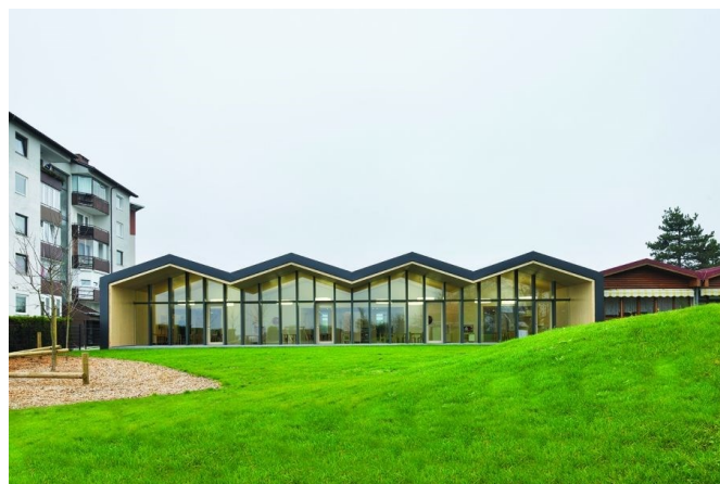
Fig. 9. Kindergarten in the village of Polzela, the continuing morphology of the gables, expanding the former kindergarten building.

The kindergarten in the village of Polzela was built in 2014, it was designed as a wooden extension to the existing kindergarten in the village; the investor was the municipality of Polzela. The roof of the kindergarten consists of several gables which are a natural continuation of the existing building (Fig. 9). The original building can be characterized as a prefabricated wooden structure with elements of brick walls; unfortunately, there is no visible wood in the interior. It can only be found in the new extension to the building. The roof is made of prefabricated sandwich wood panels used in the construction of shopping centres, which is an innovative and low-cost solution. The construction took only four months, including the modified outdoor playground. The extension expanded the original kindergarten with five new playrooms (Fig. 10), a gymnasium, a teacher's room, and an intergenerational centre. The questionnaire indicated that the wooden material has a warm effect not only on children but also on teachers and educators; its colour and texture calm them and gives them a feeling of a natural environment or a feeling of greater cosiness. When asked if they would change anything related to the architecture in their school, respondents offered no objections to wood as a material. Their reservations were directed exclusively towards construction-architectural solutions or technical installations.