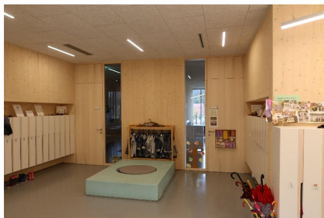
Fig. 12. Hallway space and a view of the playroom with CLT load-bearing panels with a fine finish.