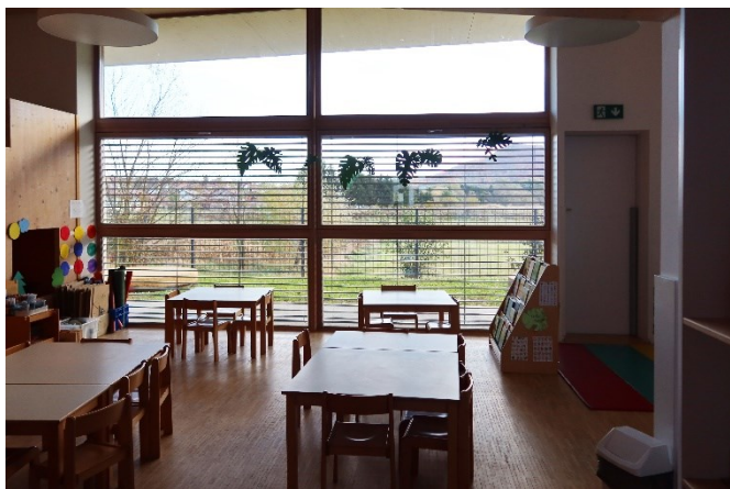
Fig. 3. Playroom space with a view of nature that takes into account the height of children (without a windowsill).

In the questionnaire, in connection with wood, we encountered answers that wood appears to be warm and natural, allows children to feel relaxed and open. The wood material has a stimulating effect on children and is important for their proper development and growth. The questionnaire indicated that the teachers perceive the wooden material as a material that evokes warmth and is natural; some respondents even claimed that, in addition to the feeling of warmth, wood gives a feeling of tenderness, beauty, calmness or even stability. Wood has a calming effect on teachers, and in this context, they emphasize the importance of visiting the forest as a place where one can mentally relax. In general, they perceive wood as a warm material. Children feel better because of the feeling of home; wooden walls are softer and warmer to the touch; children are proud of the kindergarten and like to go there. When asked what they would change in relation to the school's architecture, respondents offered no objection to wooden materials. Minor reservations were mentioned regarding the position of the coat hangers in front of the classrooms, or the large distance between the first and last classroom.