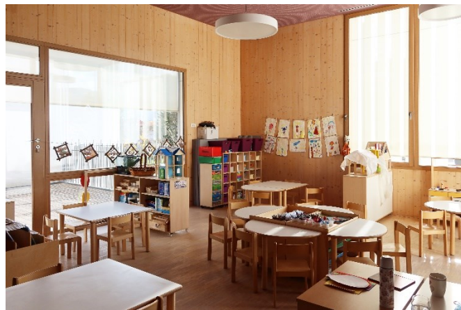
Fig. 8. The interior of the playroom or classroom is largely filled with wooden materials.