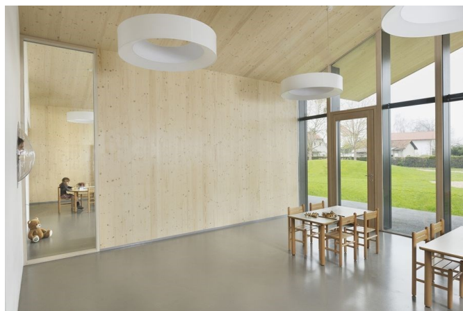
Fig. 10. Interior of the kindergarten in the village of Polzela, panels with exposed wood induce a feeling of warmth in the users.