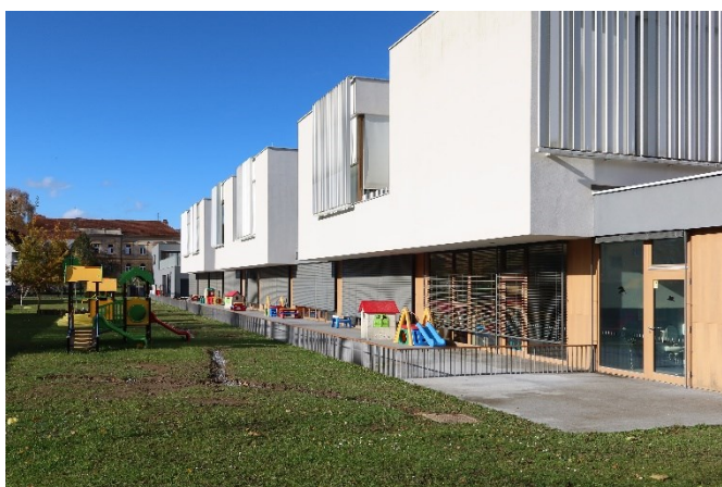
Fig. 7. Kindergarten in the village of Šoštanj, the design of the facade of the school does not indicate that it is a wooden building.

Another object of study is a kindergarten in the village of Šoštanj, the state educational facility built in 2014, with the municipality of Šoštanj as the investor. The exterior design of the building does not indicate at all that it is a wooden structure (Fig. 7). On the contrary, the interior pleasantly surprises with wooden elements (Fig. 8). The architecture of the kindergarten is designed as a two-story building with simple volumes, consisting of cubes of playrooms or classrooms shifted in height and plan, between which there are spacious play terraces below and above each other. The questionnaire again captured statements that characterize wood as a material that has a very warm and soothing effect. Teacher Taja Kidrič claims: "Man has always been connected to the forest, trees and nature. The forest and trees have always offered us protection and food, wood certainly has a good effect on psychological well-being" , he continues: "Wood has a very positive effect; the space seems more open, warmer and comfortable; wood as a material brings well-being to children, which indirectly affects their concentration during educational processes" .