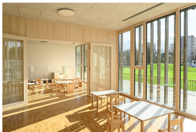
Fig. 13. Playroom space with wooden floor.