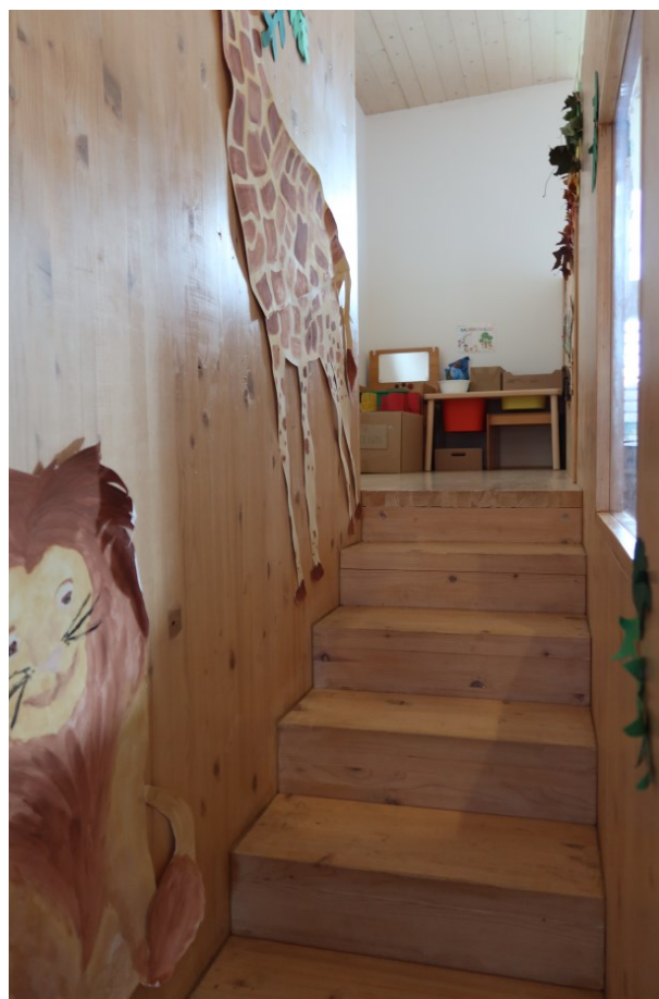
Fig. 4, 5. Above: Playroom space with "children's half-floor". Below: Wooden staircase leading to the "children's half-floor". (Photo: Jakub Hanták, 2021)